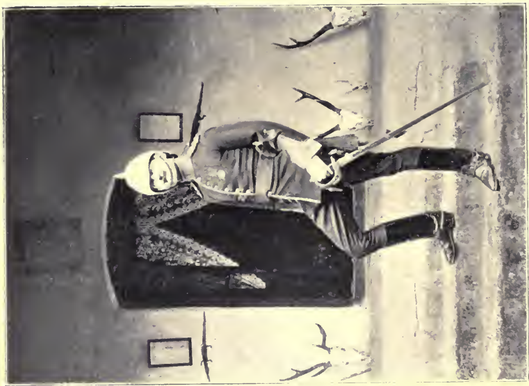
'FROM MY DOORSTEP I WATCHED THEM COMING DOWN THE HILL.'